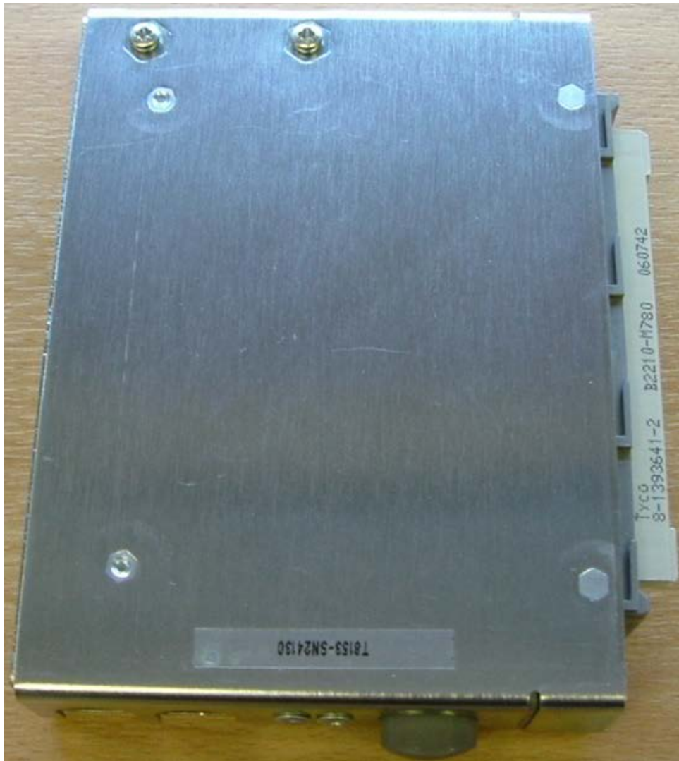
Figure 1 T8153 Photo

The Trusted Communication Interface Adapter T8153 is designed to be connected directly to the rear of a Trusted Communication Interface Module in a Trusted Controller Chassis T8100. The Assembly provides a communications connection interface to remote systems. Connection between the Assembly and the Trusted Communication Interface module is via a 78+2-way Inverse DIN41612 M-type connector (SK1).